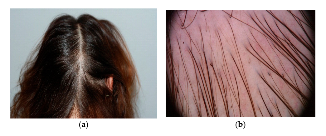
Figure 4. (a) Small alopecic patch at the site of attachment of previous hair extension; (b) Dermoscopic aspect of traction alopecia: multiple broken hairs in a non scarring patch of alopecia.

Trichobezoars formed by the consumption of hair extension is a rare cause of Rapunzel syndrome, which requires surgery and psychiatric examination [19,20].