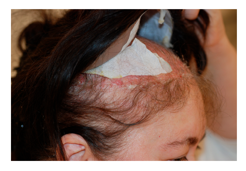
Figure 6. Severe contact dermatitis of the scalp due to wig glue.

Patients affected by alopecia areata can cover the scalp using many different styles of hairpieces, which are made with human or synthetic hair fibers tied or woven to a fabric base. In particular, human hair wigs are the most expensive, and they need to be washed and styled every two weeks, lasting 2–3 years. Synthetic wigs are stronger and easier to maintain. Types of hairpieces include: wig, demiwig, toupees, fall, cascade and wiglet [22]. Allergic contact dermatitis due to incorporated glues or natural rubber latex car occur (Figure 6).