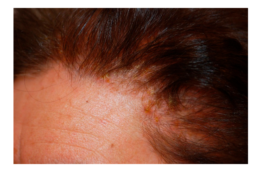
Figure 1. Contact dermatitis of the scalp due to permanent dye.

Long-term contact of dyes with the scalp can determine a contact dermatitis which can cause a telogen effluvium (Figure 1), but in severe cases can induce facial edema.