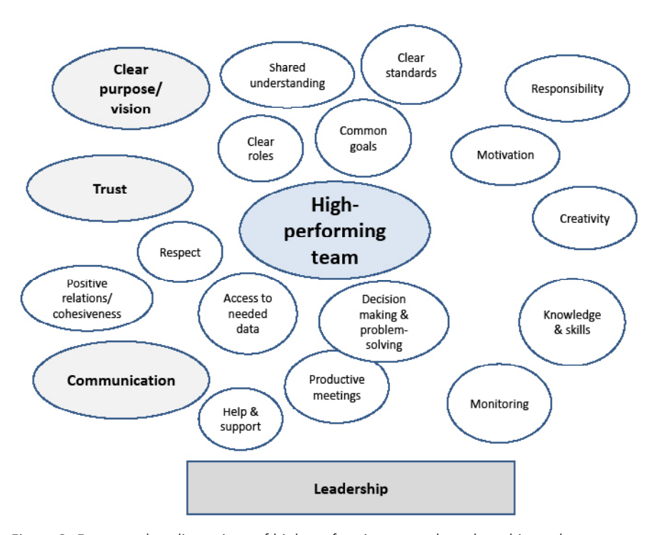
Figure 3. Framework – dimensions of high-performing teams based on this study

Based on the source literature, high-performing teams have been thoroughly studied in the past two decades, starting with initial intense interest in the 1990s, although there have not