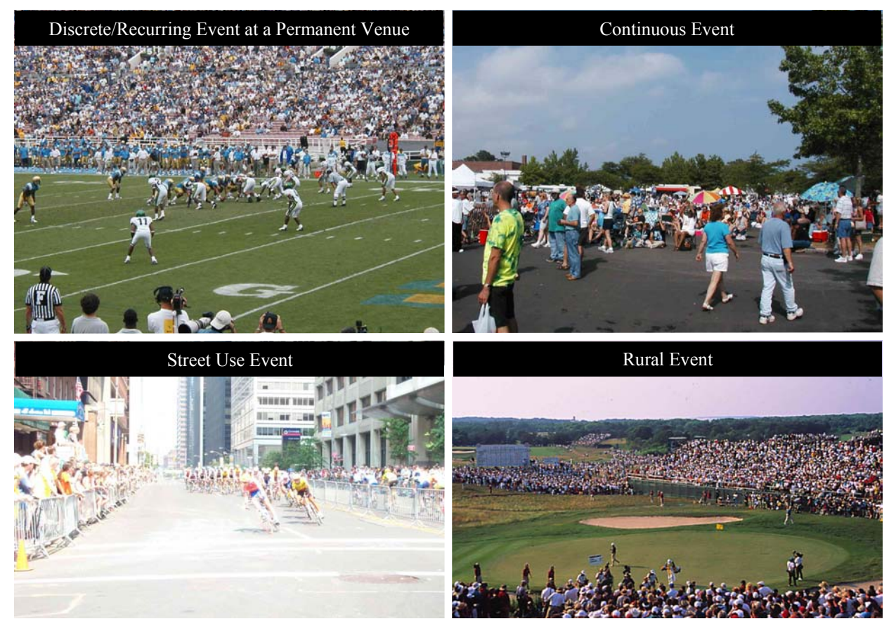
Figure 2-3 Examples of Planned Special Events

space. As a result, roadway and parking capacity issues may arise in the immediate area surrounding a temporary venue. Temporary venues may not have a defined spectator capacity, thus creating uncertainties in forecasting event-generated trips since a "sell-out" cap does not exist.