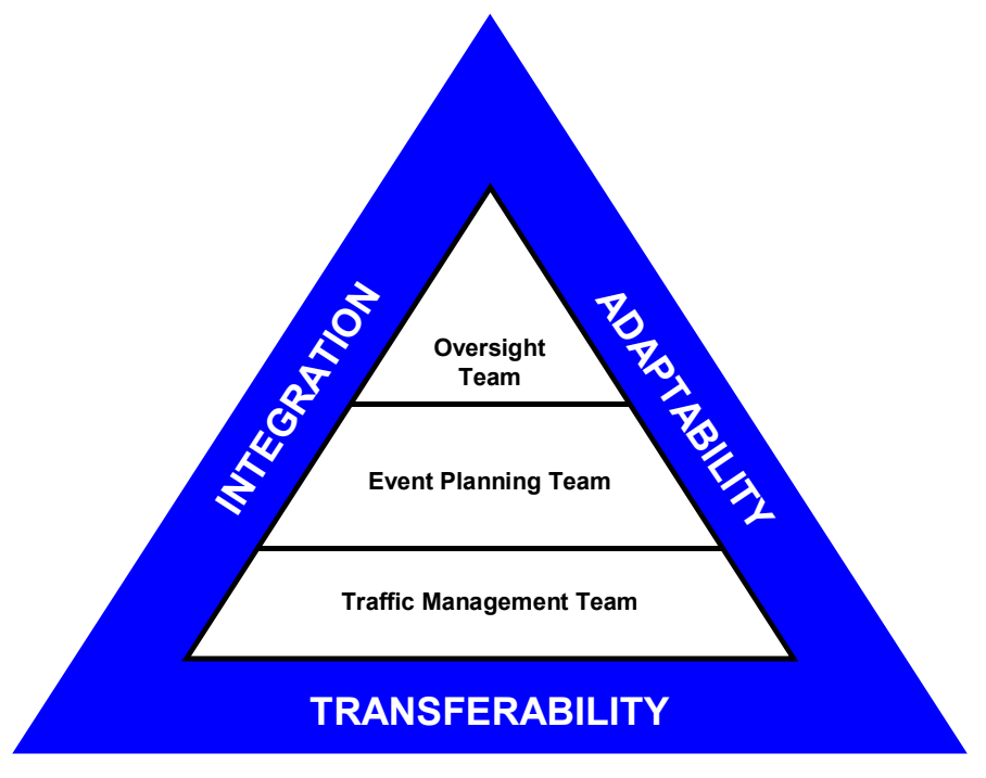
Figure 2-7 Planned Special Event Stakeholder Groups

satellite task forces. Example task forces include a communications subcommittee or task force on evaluating potential travel demand management strategies.