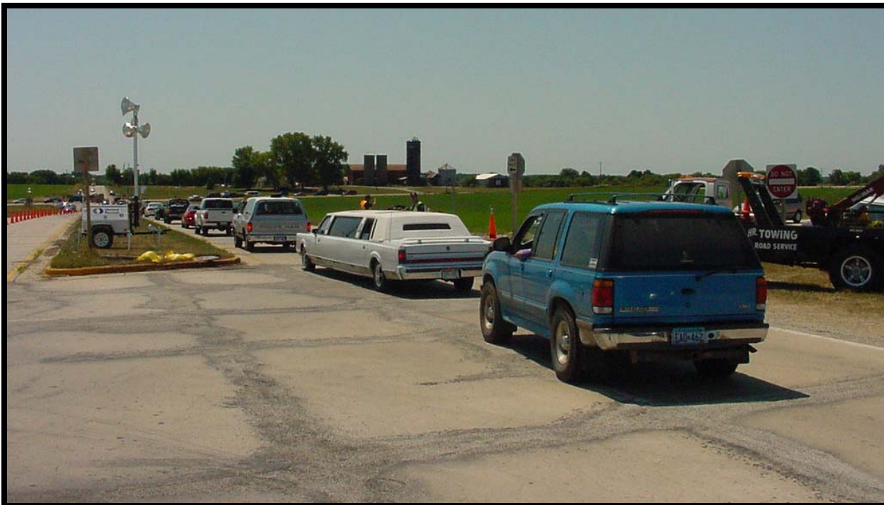
Figure 2-1 Event Traffic Management