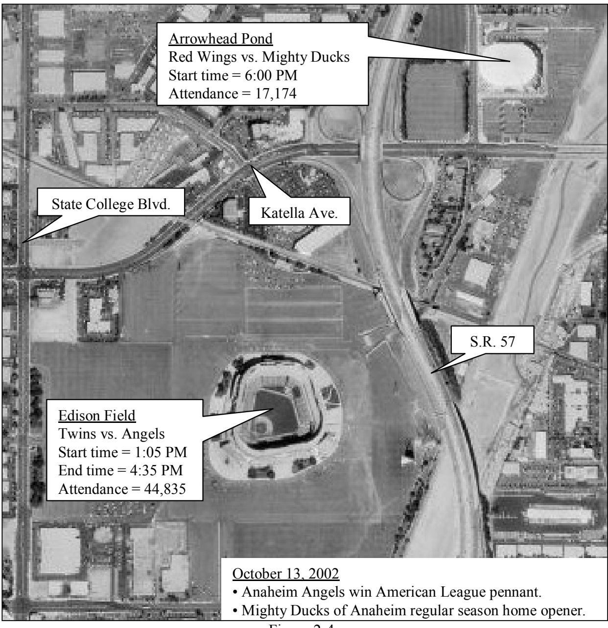
Figure 2-4 Example Regional/Multi-Venue Event

of traffic and if yes, how much impact will the event have. Answers to these questions determine the scope of the transportation management plan required to mitigate eventgenerated impacts on travel in addition to the number of stakeholders that become involved in advance planning and day-ofevent travel management activities.