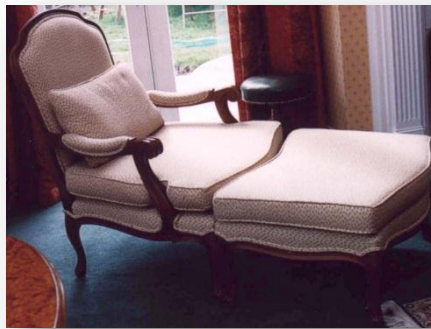
A traditionally upholstered chair and footstool

Upholstery is the padding or cushioning and covering of an item of furniture. The main aims are to provide comfort to the furniture and aid in the overall shape and form of the piece.