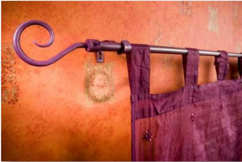
Tab top curtain on decorative rod with finial

This is a deep frill of fabric at the top of a..... more