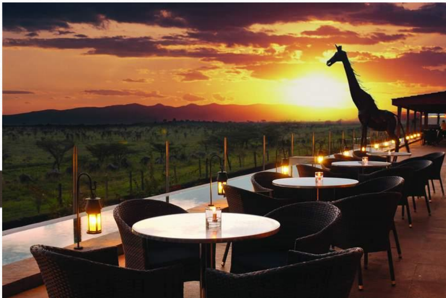
Deck and dining areas