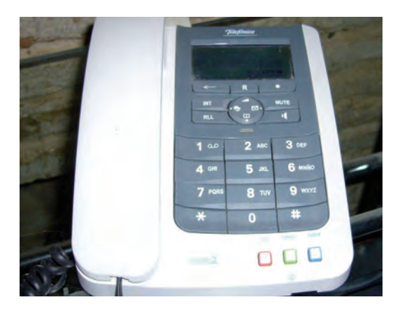
Fig. 6.1. IP PBX model.

An IP PBX is configured to send all calls using data packets through a data network (Internet), rather than through traditional telephone network. As we indicated above, companies are now replacing their traditional systems for IP PBXs because of their many advantages.