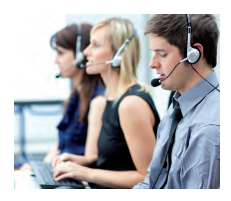
Fig. 6.7. Telemarketing workers must develop for optimal listening and customer care with each client.