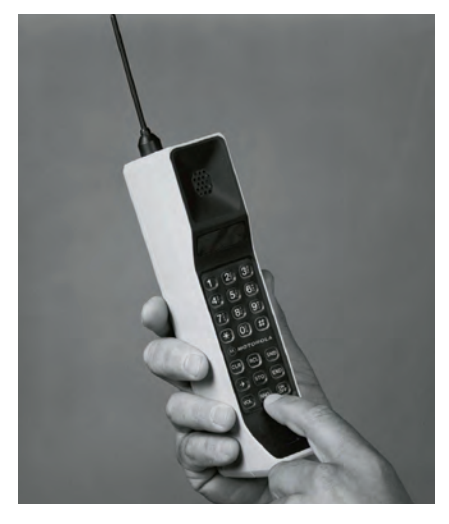
Fig. 6.3. The first mobile phone. It is the Motorola DynaTAC 8000X. It went on sale in 1983 at a price of $ 3,995. It had a weight of 0.79 kg and its battery took ten hours to charge. For its development, Motorola invested one hundred million dollars and its research lasted almost fifteen years.