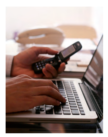
Fig. 6.6. Before calling the company offering the position, we should be informed about it as much as we can. Visiting its website may be really useful.

Finally, if we have an appointment for an interview, we will make sure the day, time and person we have the interview with, and we will write it all down to remember it.