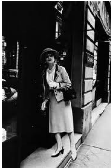
Fashion in 1950's